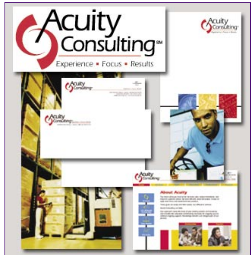
Materials created by Fresh! for the development of Acuity's brand: logo, presentation folder, stationery system, web site, and photography.

Using what we learned about the relationships between Acuity and their audiences, a new brand identity was developed, including a logo, letterhead kit, presentation materials, and web site. A "retro" look was created evoking old-fashioned values and providing a foundation for all messaging. The use of solid primary colors (red, blue, and yellow), as well as photography featuring people in action differentiated the firm and supported the invigorated brand's messaging.